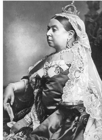
Image of Queen Victoria